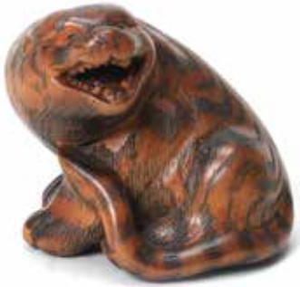
51 A WOOD NETSUKE OF A TIGER By Masanao, Yamada, Ise Province, 19th century Signed Masanao . 3.8cm (1½in) high.

£1,200 - 1,500 JPY170,000 - 220,000 US$1,700 - 2,100