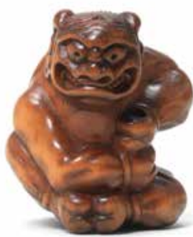
19 A WOOD NETSUKE OF AN ONI By Miwa, Edo, late 18th century Signed Miwa . 4.5cm (1¾in) high.

£1,200 - 1,500 JPY170,000 - 220,000 US$1,700 - 2,100