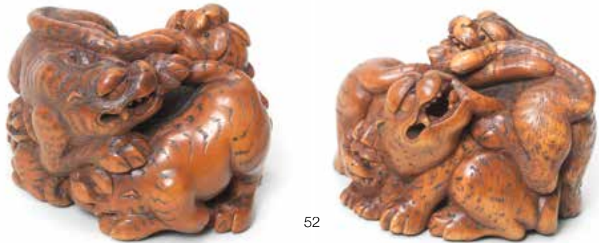
52 A WOOD NETSUKE OF A TIGER FAMILY By Masayoshi, 19th century Signed Masayoshi . 4.5cm (1¾in) wide.

£2,000 - 3,000 JPY290,000 - 440,000 US$2,800 - 4,100