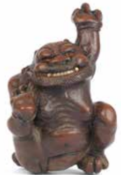
20 A WOOD NETSUKE OF AN ONI School of Kano Tomokazu, Gifu, 19th century Inscribed in an oval reserve Tomokazu . 4.5cm (1¾in) high.

£1,000 - 1,500 JPY150,000 - 220,000 US$1,400 - 2,100